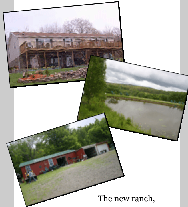
The new ranch, pond, and storage unit.

If you would like to help us in our move, please apply your donations to our expansion.